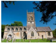
St Michael All Angels Wokingham The Church of England's first zero carbon church in the modern era